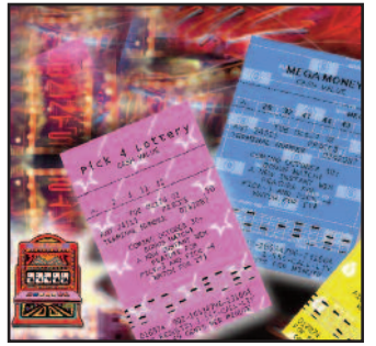
Thick Ticket Support